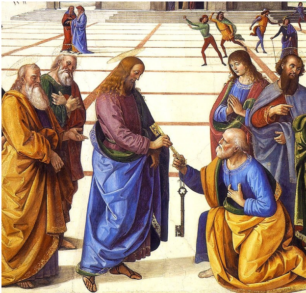
Christ Handing the Keys to St. Peter Pietro Perugino (1448-1523)